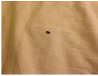
Bed bugs bite man in San Antonio motel