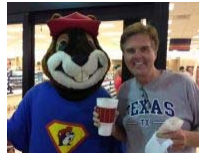
Joaquin Castro to boycott Buc-ee's after...

Pat Robertson: Asteroid could destroy Earth as soon as next week