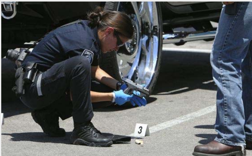
Police examine a handgun at the scene of a shooting in the parking lot of an Academy Sports and Outdoors store at Loop 410 and Vance Jackson Road. Police say a man demanded another man's SUV at gunpoint, the second man pulled out a weapon and a gunfight began.

E-mail Print Recommend 0 Tweet 0 +1 0 Pin it