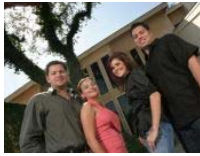
Star of 'Flip This House' sues brother